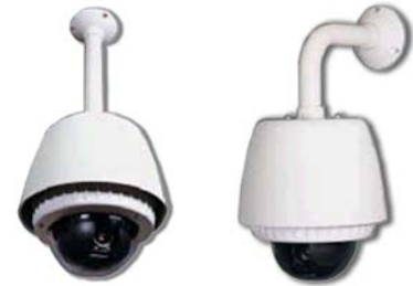
Delivered with both wall and ceiling fittings